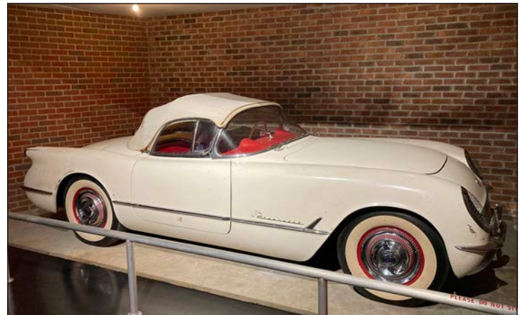
THIS 1953 CORVETTE was once encased in a brick "tomb" in a grocery store for over 25 years. It still has the original paint.